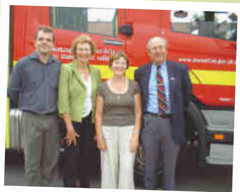
Fighting arson on Canford Heath