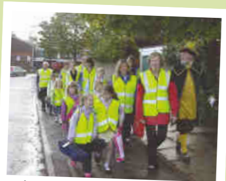
Joining the walk to school in Merley

Supporting local schools, communities and businesses