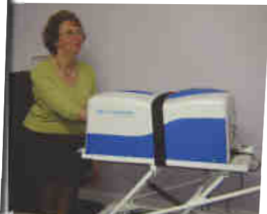
Getting a bone scan at Lytchett Matravers Pharmacy