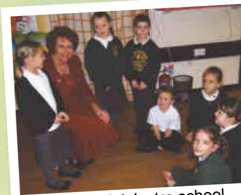
Visiting Ad-Adastra school, Canford Heath