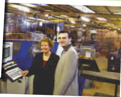
Taking a tour of Westminster Wire, Wareham