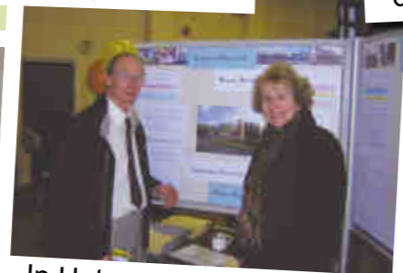
In Upton visiting the Town Plan event day