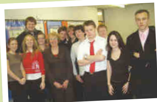
At Corfe Hills School for questions from politics students