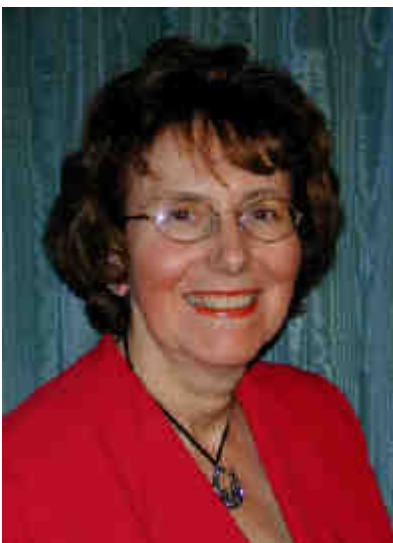
Annette Brooke MP, Liberal Democrat Children's Spokeswoman