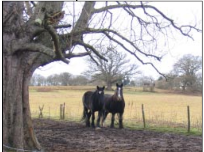
View of the Green Belt at Magna Road

Proposals for the South West suggest a large increase in the number of houses that will have to be built in Poole over the next 10 to 15 years. Some of these can be accommodated on Poole's regeneration sites around the town centre. However such brownfield sites are limited in number and it is likely there will eventually be significant pressure on the Green Belt land around Bearwood, Merley and Oakley. Unfortunately, at a recent Council meeting the Conservatives refused to support a Lib Dem motion that would have ensured greater protection for our Green Belt. Your local Lib Dem Councillors will continue to fight to protect our open spaces for the benefit of residents.