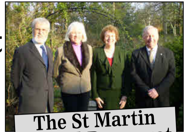
The St Martin Liberal Democrat Team say:

Conservatives are petitioning the Government to reject the proposals in the Draft Regional Spatial Strategy. Do they realise this could kill important road proposals , including the Sandford – Holton Heath Bypass, improvements to the A31 road and the new Poole bridge; leaving our area without a plan for the future?