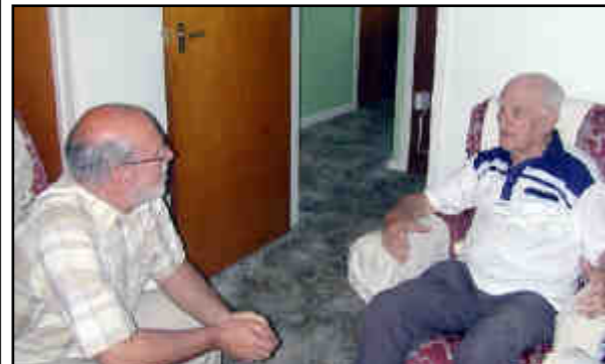
Many pensioners are concerned about cuts to home care and bus services