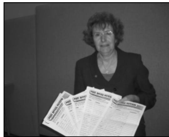
Annette Brooke MP will work with your local Lib Dem Councillors to fight for local Post Offices if they are threatened with closure.

The Government recently announced shocking plans to cut 2,500 Post Offices. This news came on top of the 7,500 post offices closed under successive Labour and Conservative Governments.