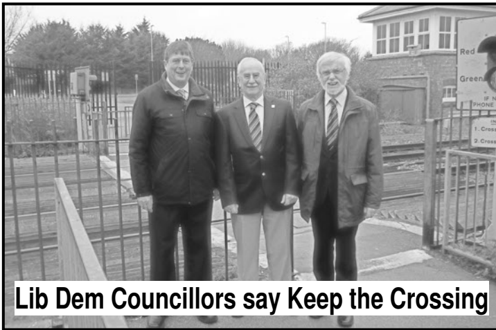
Lib Dem Councillors say Keep the Crossing

The Office of Rail Regulation (ORR), whose responsibilities include rail safety, has welcomed the improvements to the footpath crossing of the railway adjacent the station but has called for a risk