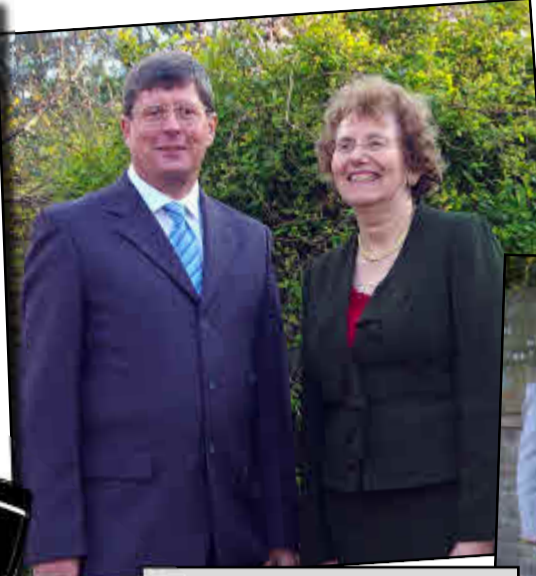
The Wareham Lib Dem Team