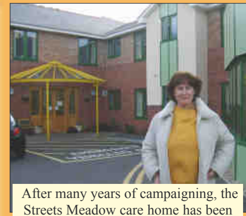
After many years of campaigning, the Streets Meadow care home has been rebuilt with new facilities